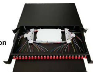
SC LC Type