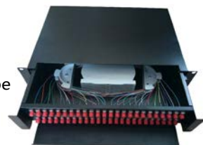
FC ST Type