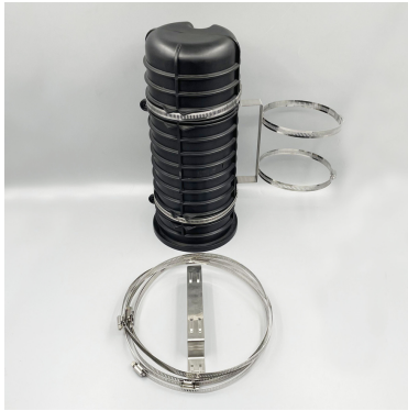
Pole mounting (C)