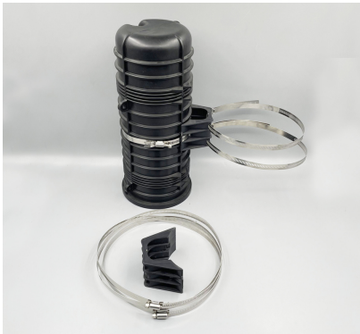
Pole mounting (A)