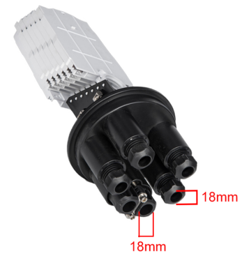
Mechanical seal Type