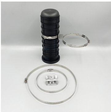
Pole mounting (A)