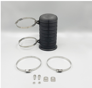
Pole mounting (B)