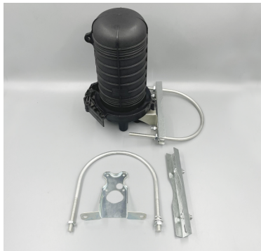
Pole mounting (A)